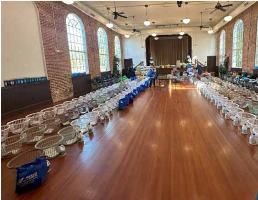
150 Baskets to be filled with laundry items.

In the month of January, we received word that the Holy Family Center was asking for donations of laundry detergent to help the elderly. Our Chapter Donated $50 of laundry detergent. Our community means a lot to us and when we know there is a need we don't mind helping.