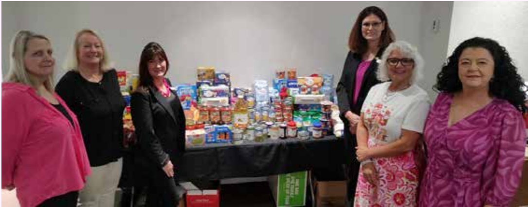
The photo shows one half of the items collected along with the FCCD Board.