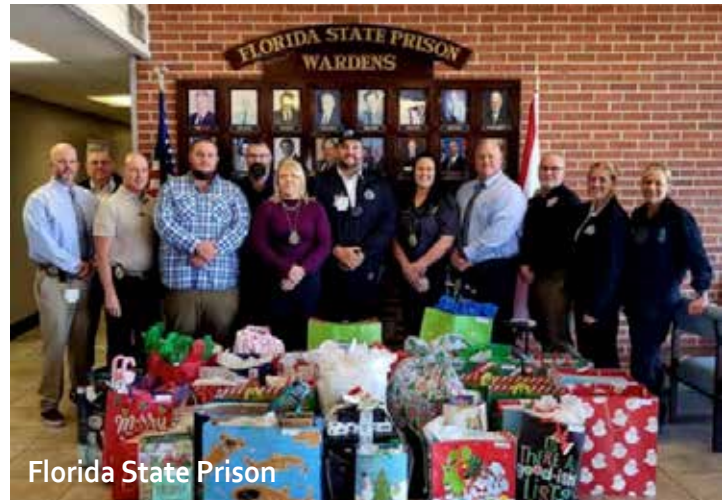
Florida State Prison