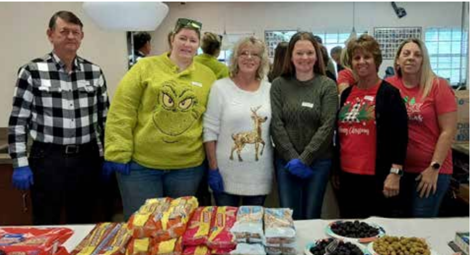
Annual meet and greet for the Veterans...