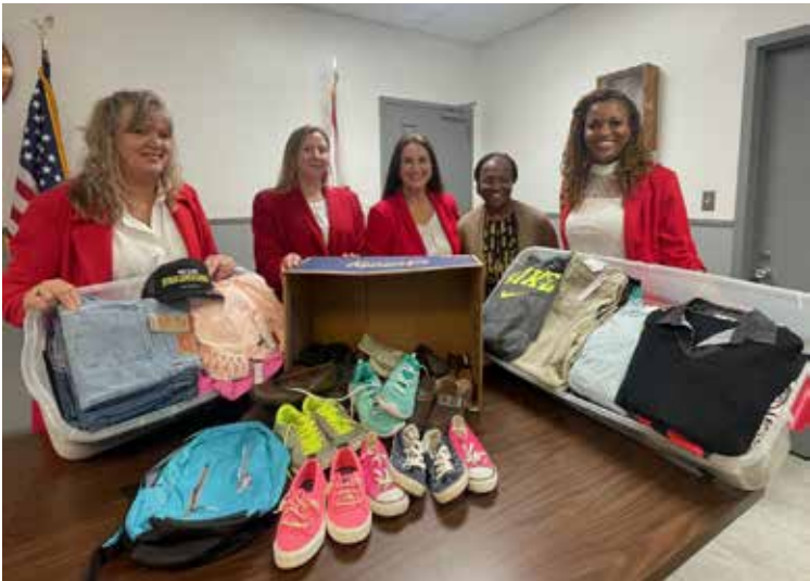
Items collected that were new to slightly used for the Sunrise of Pasco County (Domestic & Sexual Violence Center)