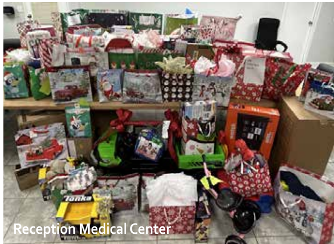
Reception Medical Center

On December 6th, Chapter 5 also brought joy to 80 of the 250 children in the Guardian ad Litem program for Columbia County with thoughtful presents. This year dedicated staff from Columbia Correctional Institution and Baker Re-Entry Center came together to make this positive impact. We also pledged to take on more children from their list next year.