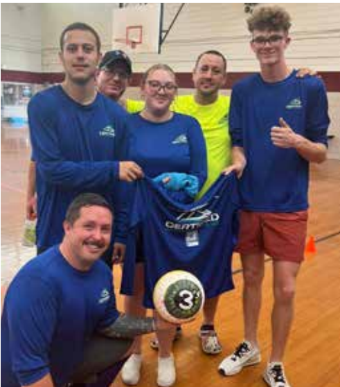
Third Place: Slade Certified Roofing-Ocala

Thank you to all the teams that participated and we are looking forward to hosting more teams next year.