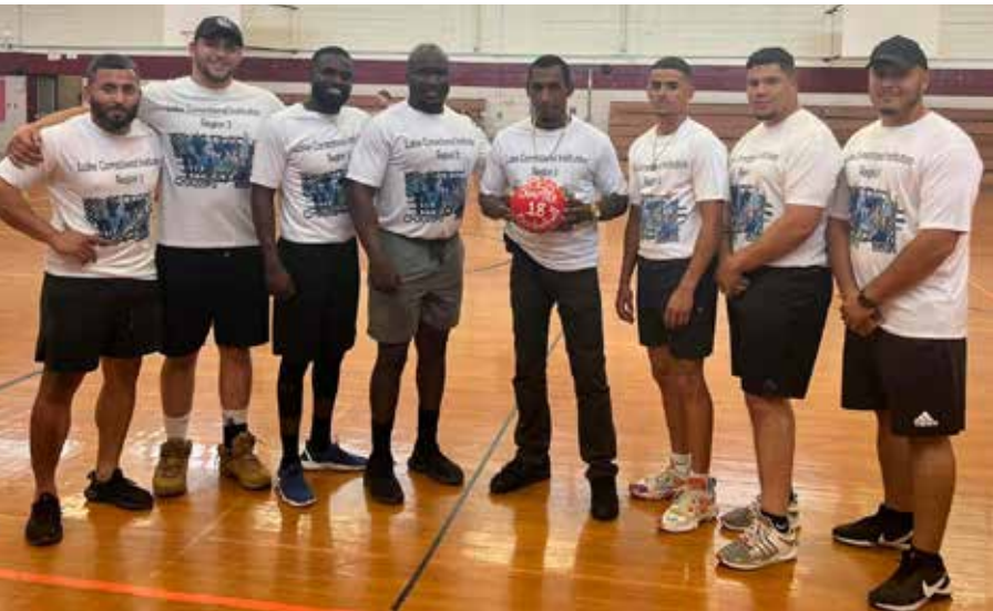
Second Place: Lake C.I. Lakers