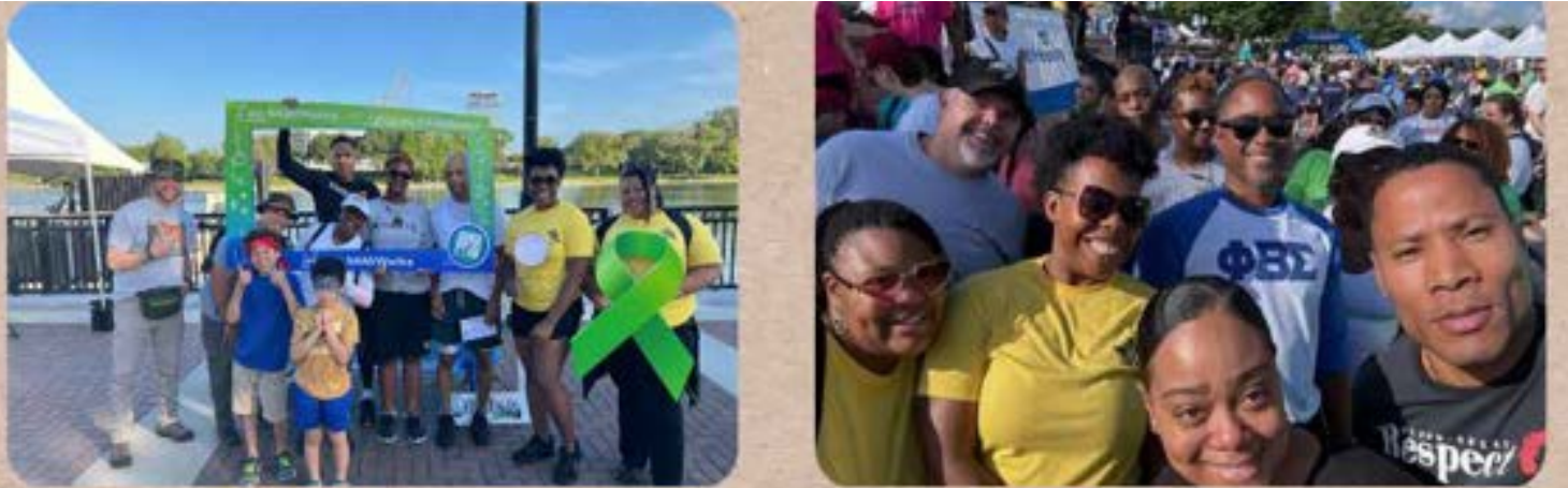
Chapter VII was in attendance for the 2024 5k Nami Walk. Chapter VII members were able to not only participate in the 5k walk, but also enjoy raffles and other entertainment such as dancing.

NAMI is the National Alliance on Mental Illness. They are the country's largest mental health organization. NAMI is dedicated to improving the lives of millions of Americans affected by mental illness.