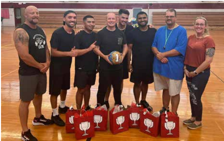
First Place: Loaded Minion (Border Patrol)

The winning team received a custom painted dodgeball, along with gift bags from Element Spin of Ocala. The second and third place teams also received a custom painted dodgeball.