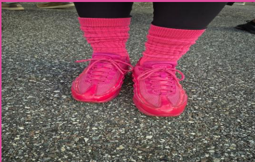
Boots on the Ground!!