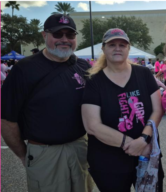
Chapter 20 New Board Members